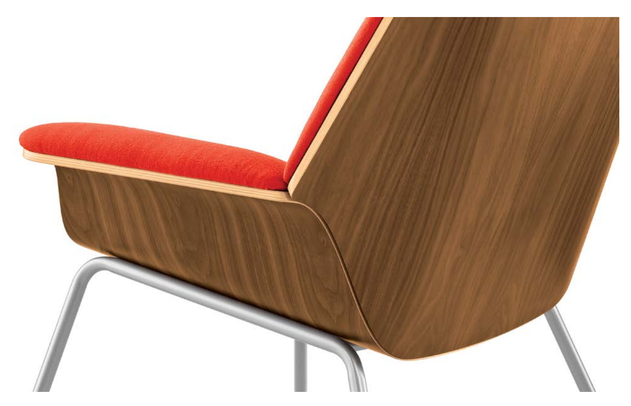
The \ exposed \ shell \ of \ the \ plywood \ lounge \ chair \ is \ a \ subtle \ reference \ to \ the \ iconic \ designs \ of \ Charles \ and \ Ray \ Eames.