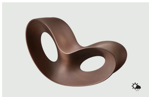
Rust Brown 1071 C