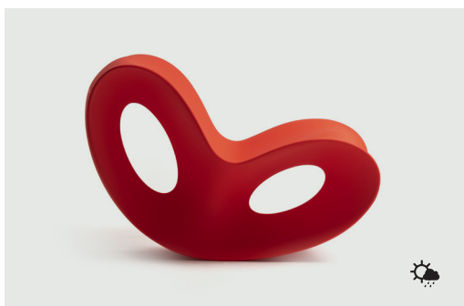
Red 1004 C