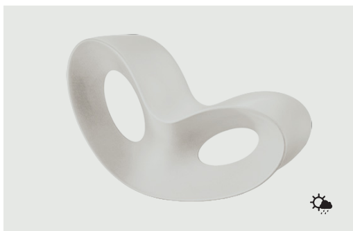
Light Grey 1395 C