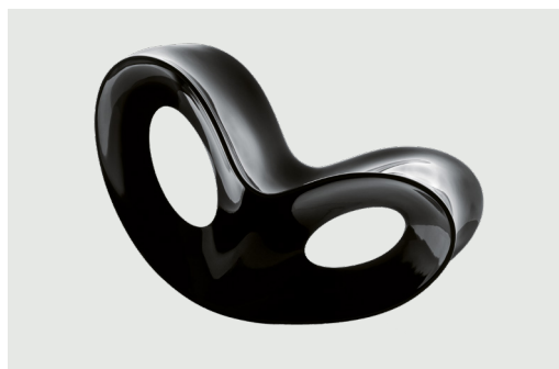
Glossy Black 1763 C