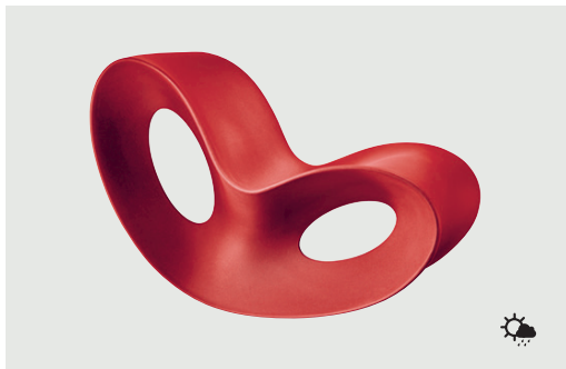
Orange 1110 C