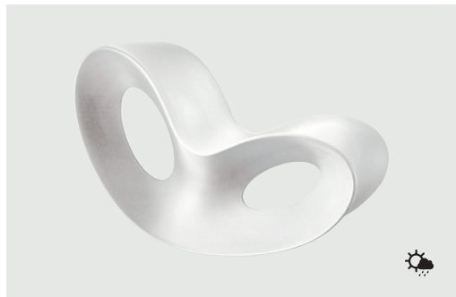
White 1735 C